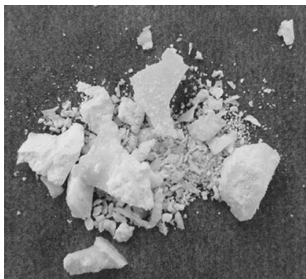
Fig. 2 CVT extracted from the CTT seed

On the other hand, SO is a liquid at room temperature and displays different colors with different extraction conditions. The color of SO progressively increased in darkness from pale yellow to light brown with the following method and solvents used in extraction: SC-CO 2 , petroleum ether, diethyl ether, hexane, and 95 % ethanol (Fig. 3). As discussed in the previous section, although the yields of SO by different solvents were similar, the composition of extracted oil may be different. Extraction temperature could play an important role in the differences in the resulting SO samples. For instance, the SO extracted by hexane at higher temperature displayed a darker color than that from petroleum ether even though their polarities are similar. It has been reported that the partial thermal degradation of saccharides and protein under a high extraction temperature could increase the color of SO [12].