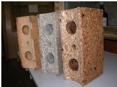
Figure 1: Guardrail block (Side view)

Three groups of composite blocks were produced: (1) wood 75%, polypropylene (PP) 25%, urea formaldehyde (UF) 8%, isocyanate (ISO) 1%, 53 pcf, (2) wood 75%, plastic 25%, UF 8%, ISO 1%, 43 PCF, and (3) wood 87.5, plastic 12.5%, UF 8%, ISO 1%, 43 PCF. Blocks were pressed at 204°C and 15 min press time. Six replications were made of each group. Samples were cut and tested in accordance with ASTM standards for IB, bending MOR, bending MOE, LE, and TS. Figure 1 illustrates some examples of the compression molded blocks that were fabricated.